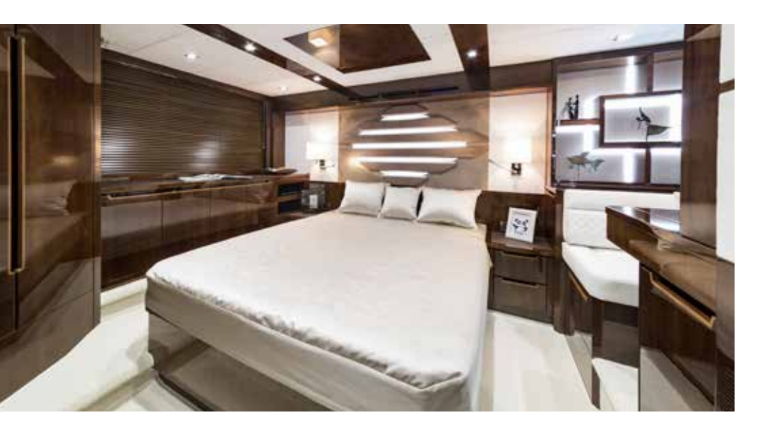
Large windows make the master stateroom light and airy. Accent lighting makes it elegantly contemporary.

very detail of the Galeon 550 FLY conveys the exacting standards and incredible craftsmanship that combines the skills of old-world artisans with the latest boat building technologies. With three decks engineered to maximize opulent space for all on-board to luxuriate in comfort, the elegant and refined Galeon 550 FLY is the epitome of form and function coming together in harmony. Experience a yacht that reflects Galeon's commitment to excellence, experience the 550 FLY.