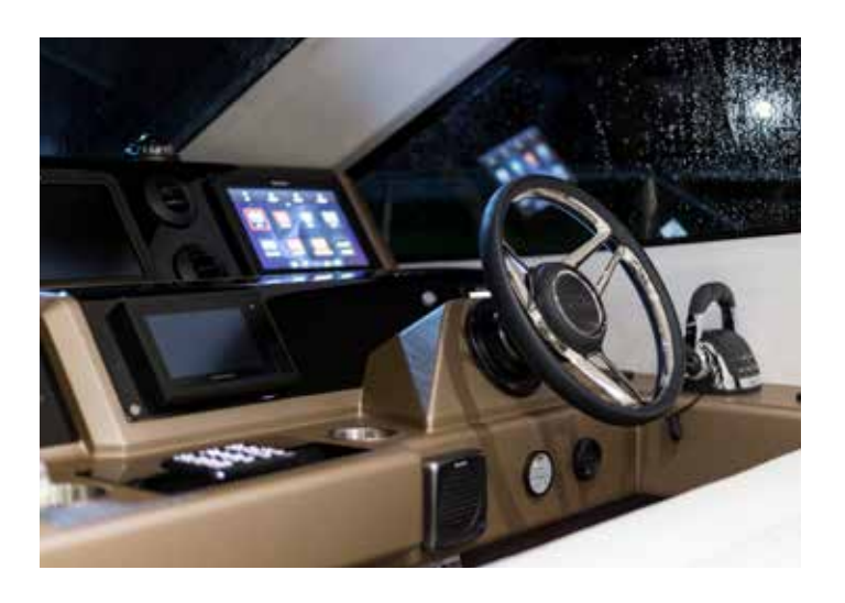
The fully equipped helm is positioned to keep the operator engaged with guests while underway.