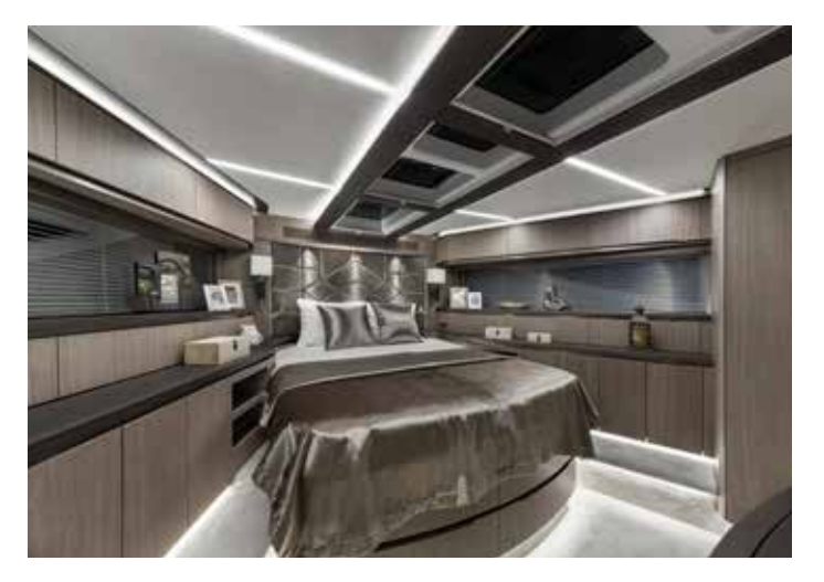
Luxurious accomodations await including two owner's staterooms with plush centerline beds and en-suite heads. Choose your favorite, full beam centerline or forward centerline (pictured).