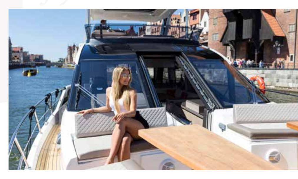
Galeon's award winning innovation allows the windshield to open for unfettered access to the bow.