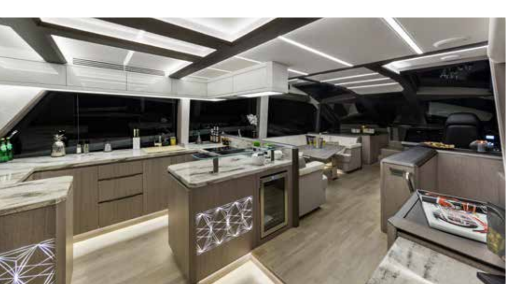
Scenic views abound through large sweeping windows throughout the saloon, forward helm and gourmet galley.

he Galeon 640 FLY transcends mere form and function with stunning contemporary design and expertly hand-crafted interiors. This transformer yacht is revolutionizing the segment with its innovative approach to layout. With powerful Volvo propulsion systems and advanced electronics and controls, the Galeon 640 FLY will deliver experiences that create lifelong memories of times spent with friends and family. All with a style that will make its owner the envy of any port-of-call.