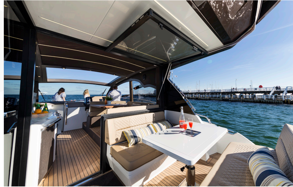
Entertaining is a breeze with alfresco dining.

T he 425 HTS is a smaller sibling to the Galeon 485 HTS. We have re-invigorated the ever popular express style yacht by eliminating the need for soft curtains while still providing a truly open yacht. Close it up and enjoy the climate controlled cockpit or open the roof, doors, and windows and you can laugh about the old days of fighting canvas to stay dry from the approaching rain shower.