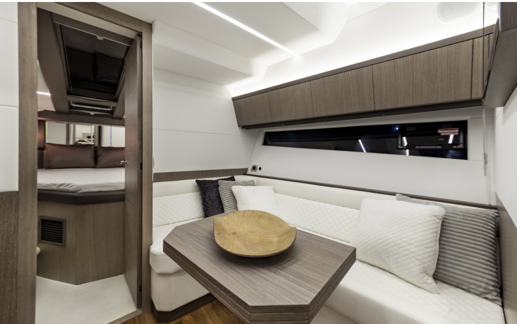
Relax in luxury in the spacious and naturally lit salon.