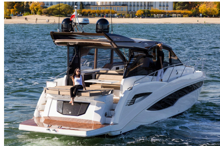
Style meets substance in this amazing new hard top sport model.

Note: Layout and features may vary from shown here due to manufacturer consideration and client customization.