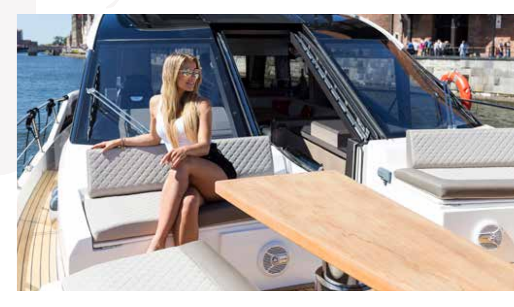
Galeon's award winning innovation allows the windshield to open for unfettered access to the bow.

Note: Layout and features may vary from shown here due to manufacturer consideration and client customization.