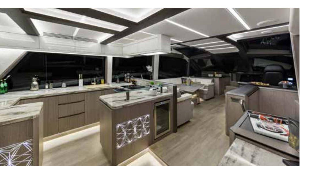
Scenic views abound through large sweeping windows throughout the saloon, forward helm and gourmet galley.

The 650 SKY is the pinnacle of design and technical prowess. Be transcended and transformed as the 650SKY leaves you breathless as her volume belies her physical dimensions and every turn offers a game changing innovation. The carbon fiber SKYdeck roof panels eloquently disappear to reveal a large bridge while the available tender garage and rotating cockpit seat provide for endless vistas and truly unique experiences onboard. With the proportions of larger yachts designed carefully into an amazing package.