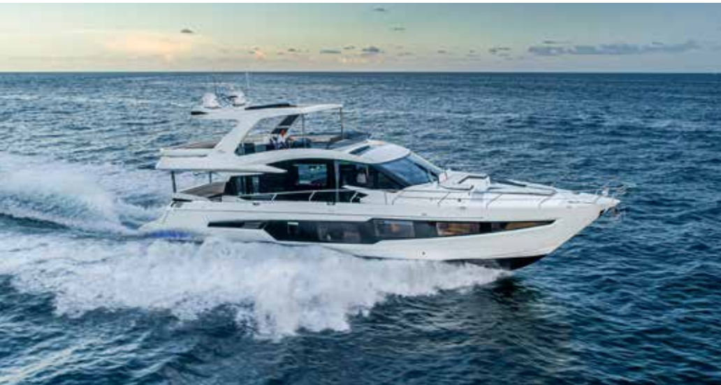
A true performer reaching speeds in excess of 30 knots.

Her design delivers more game changing features with an expandable bow and a few other surprises. Aboard you will find a light and welcoming salon with a luxurious finish while the expansive flybridge awaits your next party or family gathering.