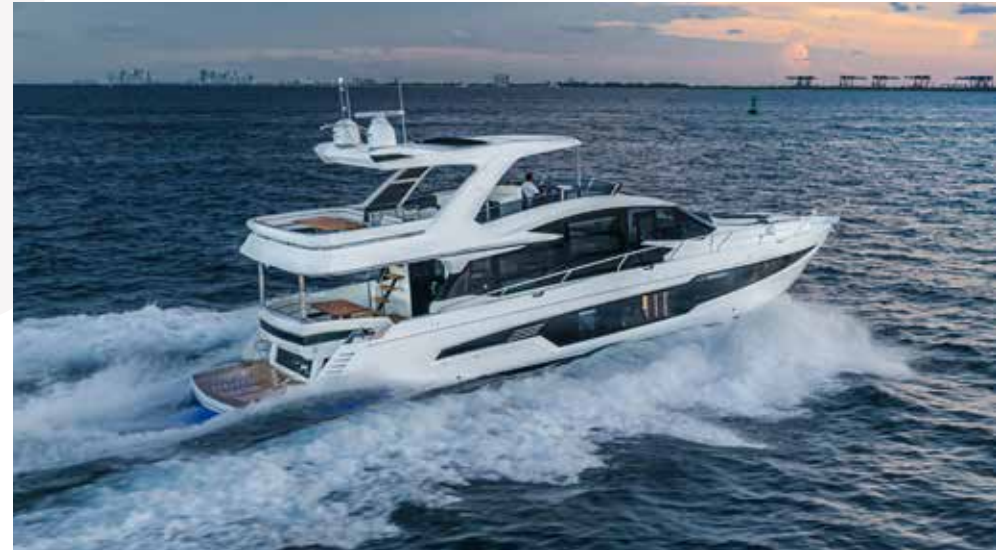
The stunning profile captures Galeon's DNA with the signature full length hull window.