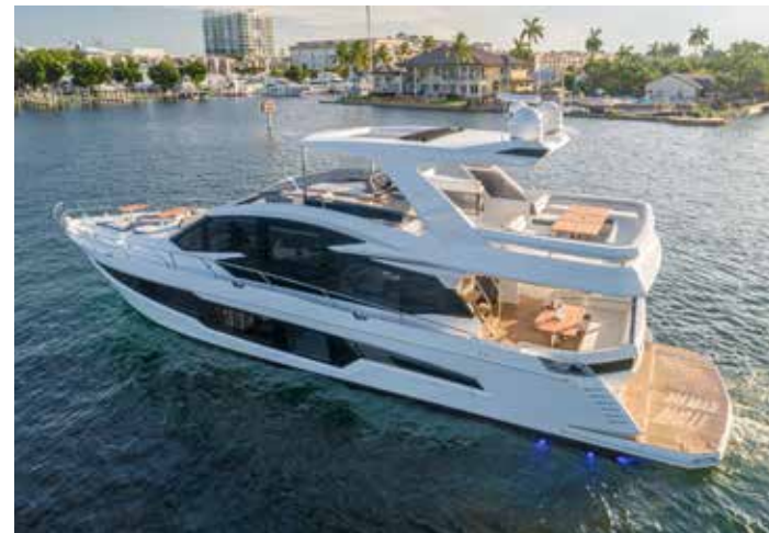
An entertainer's delight with multiple decks to please the most discerning of critics.

Note: Layout and features may vary from shown here due to manufacturer consideration and client customization.