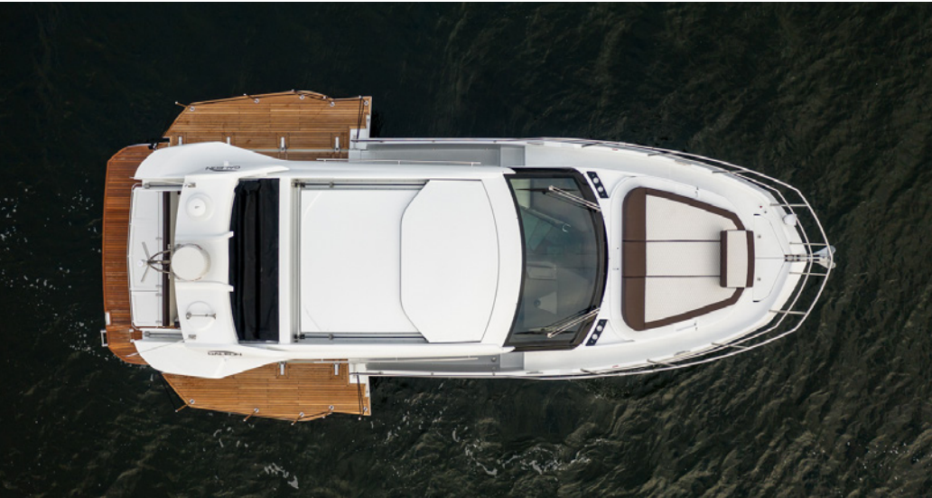
The single pane windshield and large sweeping windows provide awe inspiring views from the saloon and galley as well as providing 360-degree sight-lines from the helm.

Note: Layout and features may vary from shown here due to manufacturer consideration and client customization.