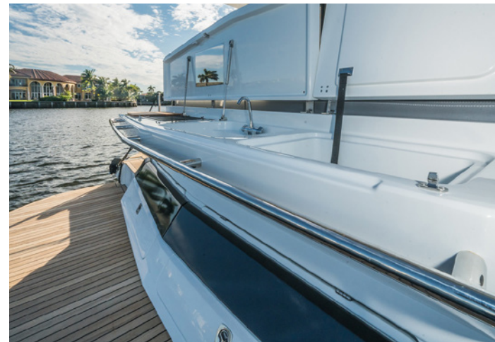
The summer kitchen allows you to easily cook and entertain.

Note: Layout and features may vary from shown here due to manufacturer consideration and client customization.