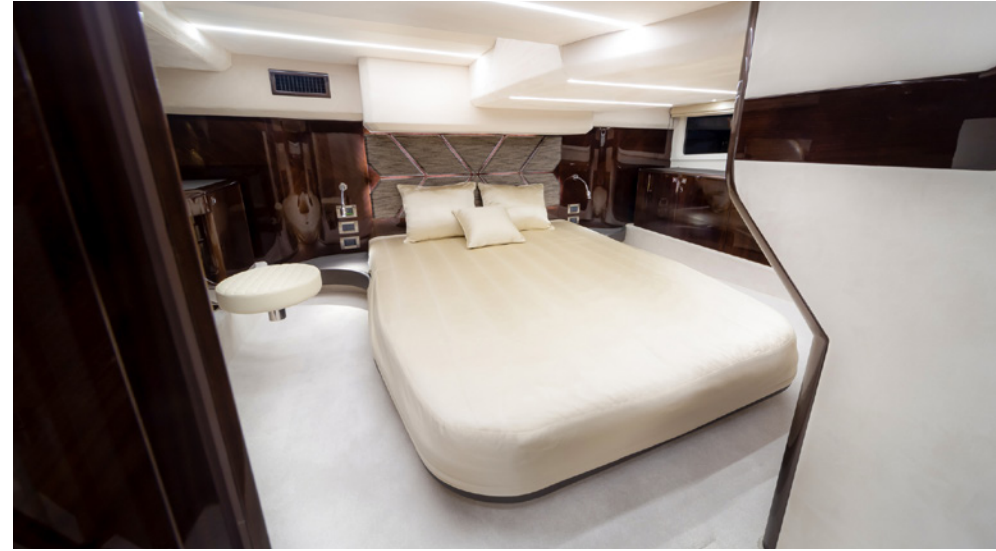
The master stateroom offers luxurious accommodations when it is time to turn in.

T he upcoming 410 HTC based on the hull of the successful 400FLY presents a more sport silhouette matched by its quality interior. The hardtop offers a large sunroof over the helm station. The foredeck offers a sun lounge with an abundance of space for leisure. A clever integrated summer kitchen on the platform ensures many amazing moments with family and friends. Everyone's favorite feature, Beach Mode, allows the use of the added deck space for entertaining and relaxation.