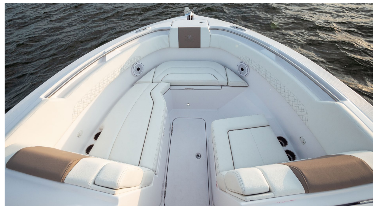
Dune upholstery package shown above.