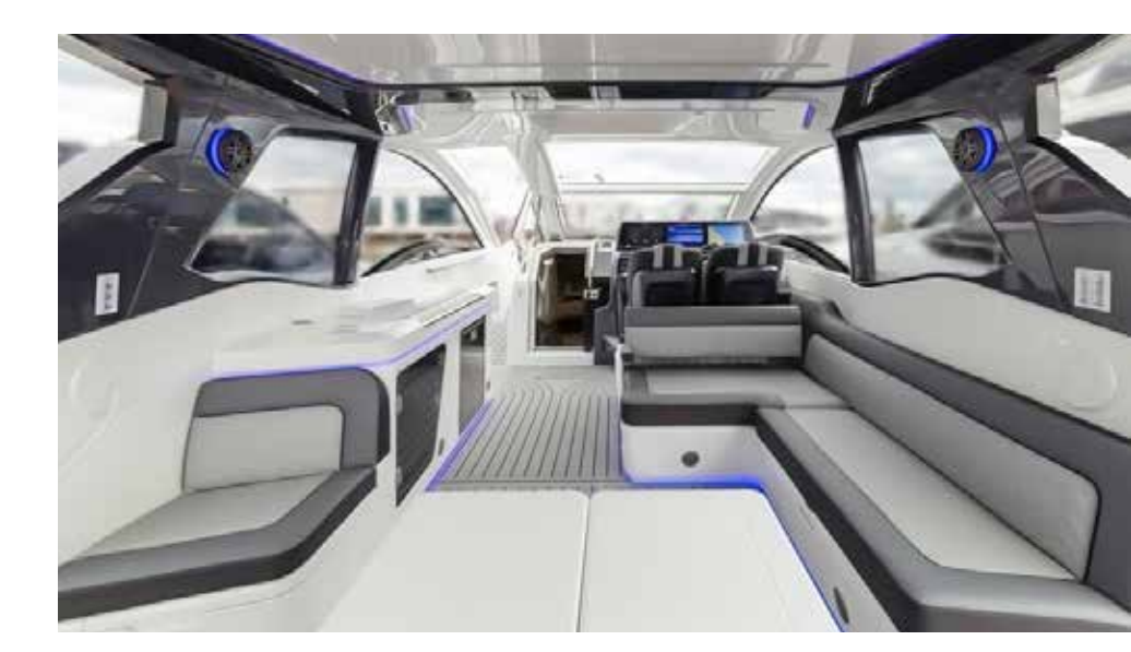
An enclosed, spacious helm offers protection from the elements with an outdoor area protected by an electric awning.

Note: The right is reserved to make changes, without notice, at any time, in equipment, materials, and specifications. Drawings, photos, and renderings may contain optional equipment.