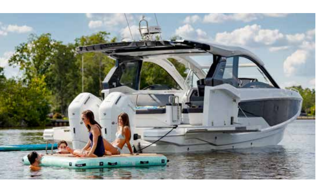
The 375 GTO has Galeon DNA in spades, and it's particularly on display when her trademark "Beach Mode" is activated.

dayboat like no other, the Galeon 375 GTO is aptly named-Grand Touring Outboard. Offering unparalleled excitement, both the boat's helm and profile take inspiration from the auto-racing world making this model nothing short of a pleasure to drive.