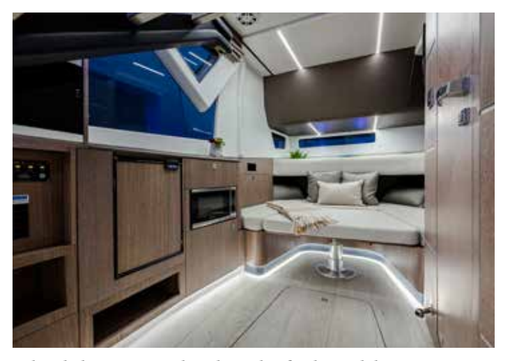
Below deck impresses with yacht quality finishes and sleeps 4, making this and enviable choice for an overnight excursion.