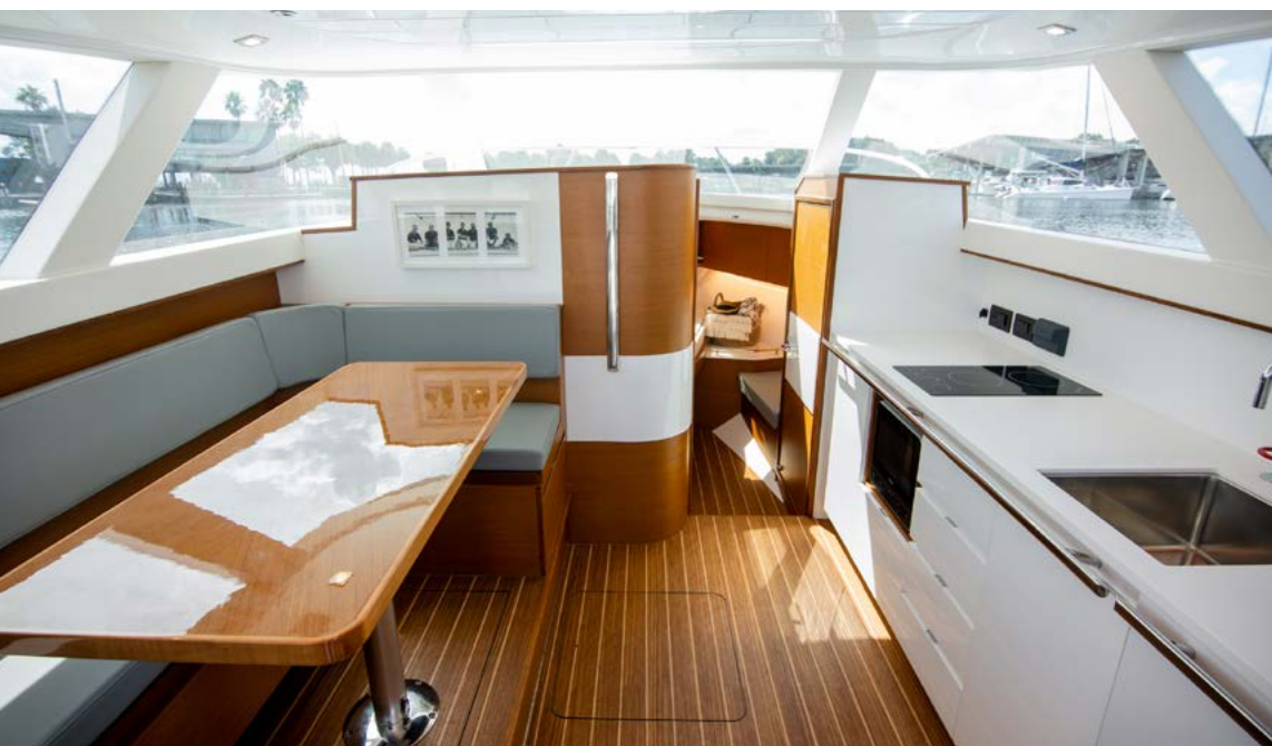
Gray interior package shown above.