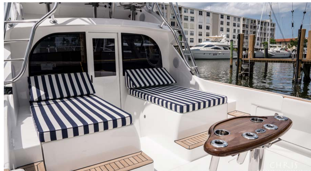
Blue and white exterior upholstery package shown above.