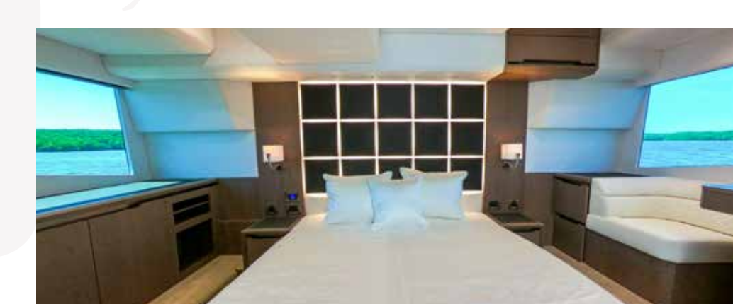
The full beam master stateroom affords the ultimate in privacy and comfort with a walk-around queen-size berth, abundant headroom and copious storage to make extended cruises a true pleasure.

The large sweeping windows and single pane windshield provide 360-degree views from the saloon, galley and lower helm. The quality of the finish that all Galeon models are known for, puts you in a world of exceptional luxury, perfect for socializing with friends and family.