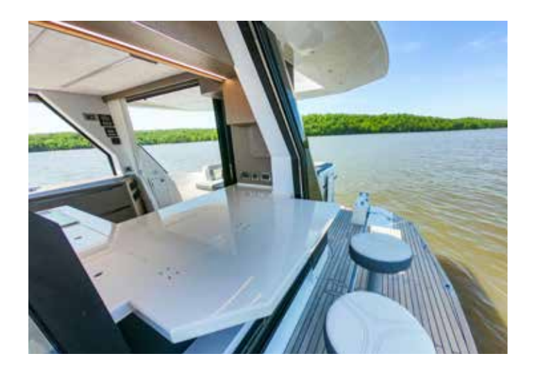
Innovation allows for a pop up bar at every dock or anchorage.

Note: Layout and features may vary from shown here due to manufacturer consideration and client customization.