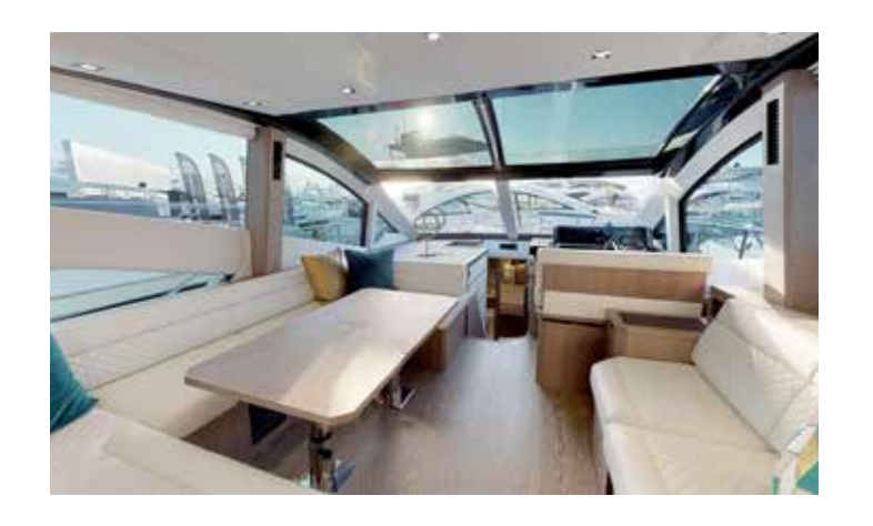
Powerful and graceful, the Galeon 560 Skydeck performs with solid poise that creates a spirit of confidence and assurance from either helm. Bring the outdoors inside with the opening sunroof and windows.