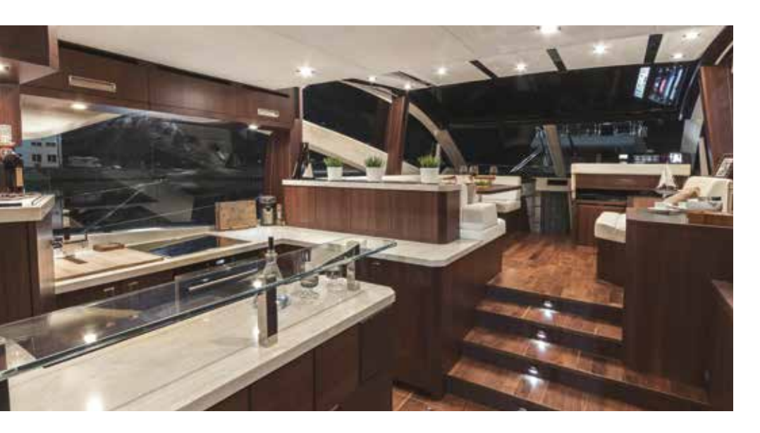
Scenic views abound through large sweeping windows throughout the saloon, forward helm and gourmet galley.

he Galeon 560 Skydeck is a magnificent example of Old-World craftsmanship coming together with innovative design and today's technologies. Every detail is forged to impress even the most demanding aficionado. Warm, rich woods, large, sweeping windows and supple materials combine to form impeccable accommodations to spend special times with family and friends or to entertain business associates in grand style.