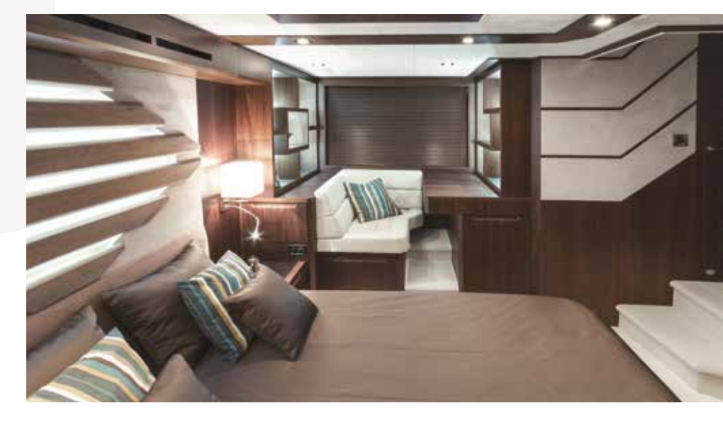
The master stateroom offers sumptuous space to enjoy private time in ultimate comfort. Enjoy morning coffee with a view on the en-suite settee.